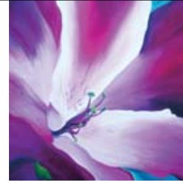
Center for New Media at KVCC 2009 Faculty Show