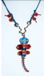
West Michigan Glass Society Glassblowing and bead making demonstrations