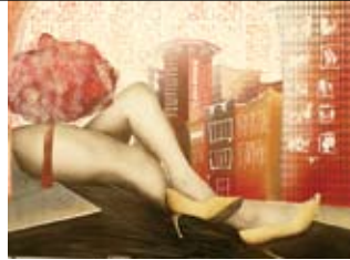
Saniwax gallery at Park Trades Center Fourth Annual WMU BFA and MFA Student Show