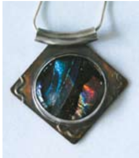
West Michigan Glass Society WMGS Artists

PRESENTED BY: arts council of greater kalamazoo