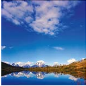
Arts Council Christopher Light