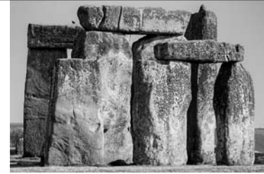
Carver Gallery Norm Carver